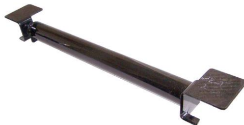
19" Float Bracket