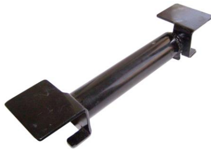
9.5" Float Bracket